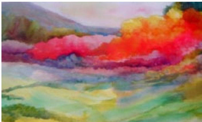
“Colorful Forest” by Sue Hunter

AWA General Meeting February 13, 2006 7:30 pm UNITARIAN CHURCH 4027 E. Lincoln Drive, Paradise Valley Church doors open at 7:00 p.m. for Fun Table Activities (Handicap entrance on West side.)