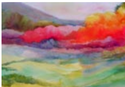
painting by Sue Hunter

Workshop February 18 from 9 to 4 Unitarian Church 4027 Lincoln Drive Paradise Valley