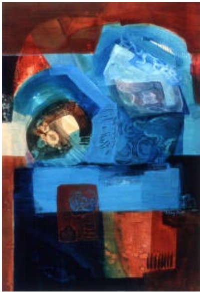
painting by Ellsy Bird