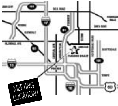
October 11th meeting at the UNITARIAN CHURCH